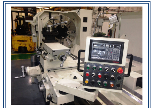
Hydraulic Copying & Semi-Auto cycle, and Newall DRO